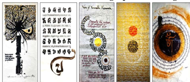
The works of Indian calligraphers exhibited in the 18th Cheongju Jikji international Calligraphy competition held in South Korea.